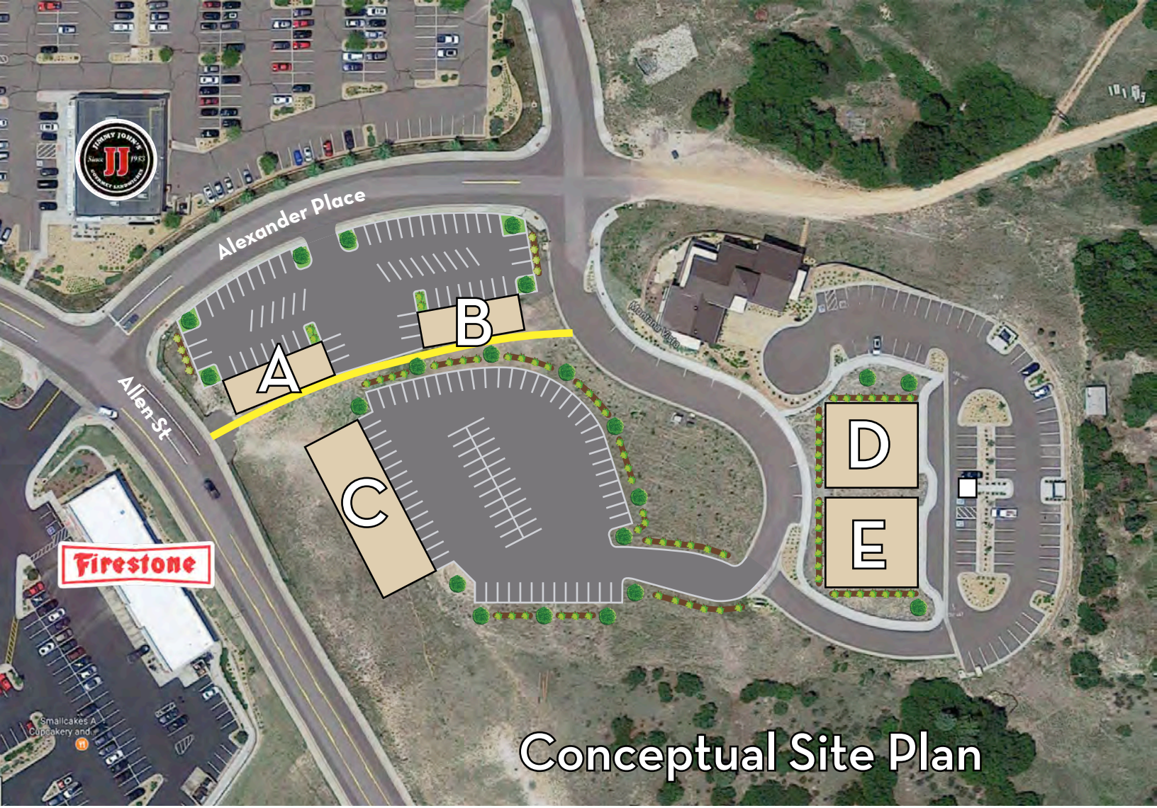
Conceptual Site Plan

FOR SALE or LEASE NE Corner of E. Allen Street & Alexander Place Castle Rock, Colorado